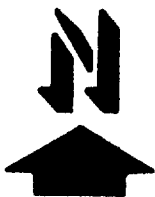
PLAT OF SURVEY OF LOT F11, ADDITION F, COUNTRY CLUB ESTATES, VILLAGE OF FONTANA-ON-GENEVA LAKE, WALWORTH COUNTY, WISCONSIN.

ORDERED BY: THE RAULAND AGENCY 118 KENOSHA ST. WALWORTH, WI 53184